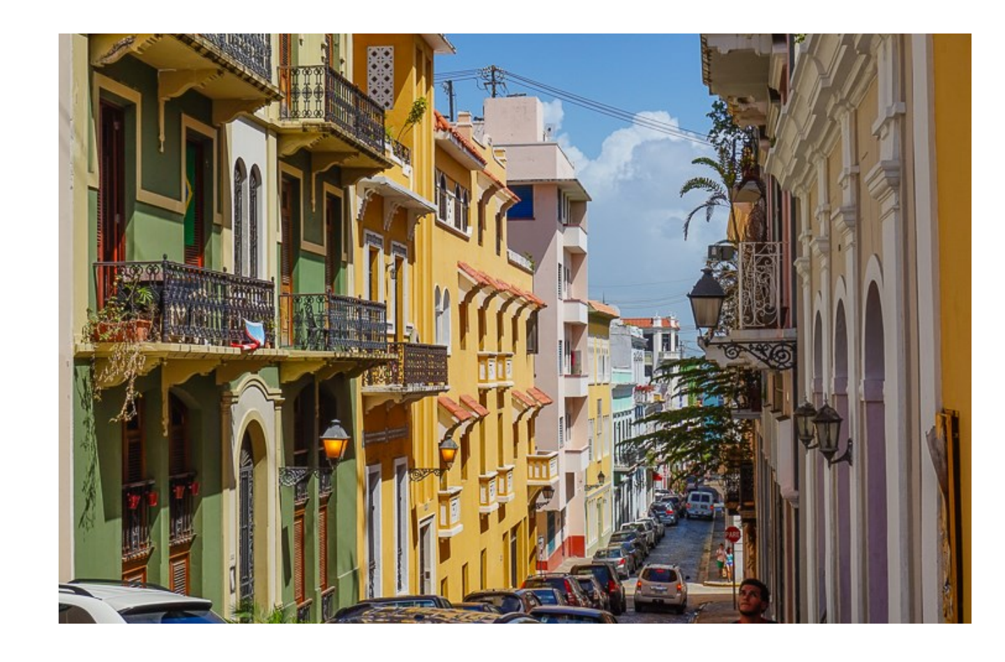
Old San Juan is spectacular in its colors and iron railings and gates.